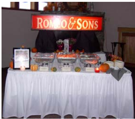
Romeo & Sons