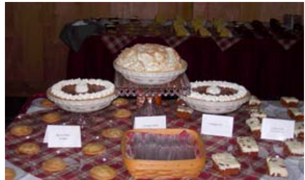
Weaver's Family Restaurant