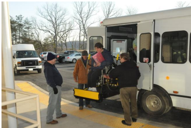
Friends Aware - Allegany County

Senior Rides applications are due to MTA in April 2021. MTA will notify TCC on announcements for (JARC) applications and TCC staff will continue to provide technical assistance to applicants applying for transportation related grants. TCCWMD is a member of the Transportation Association of Maryland (TAM) and also participates in the Allegany County Transportation Task Force, Washington County Transit Advisory Committee, and the Frederick County Transit Advisory Committee.