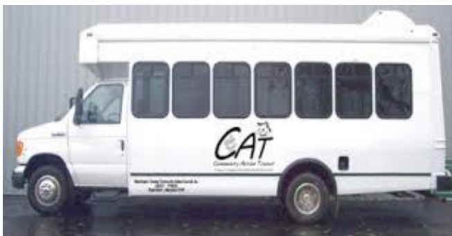
Hopewell Express Transit Service - Washington County